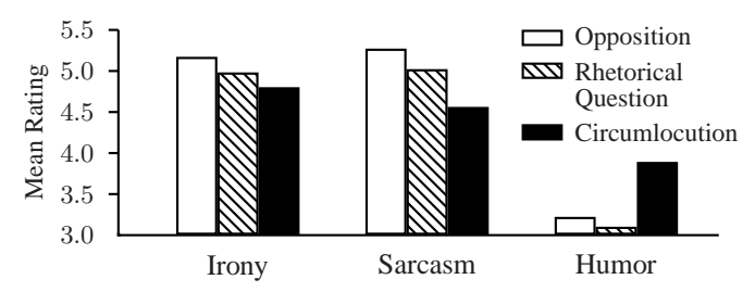
Figure 2: Mean ratings of irony, sarcasm and humor by sentence type.